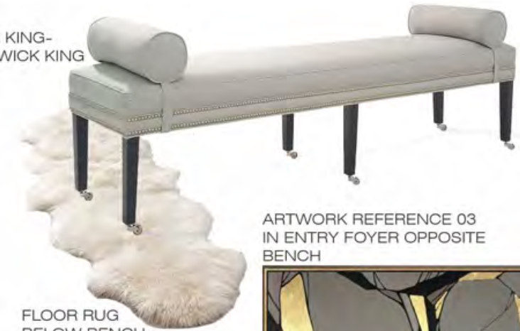
FLOOR RUG BELOW BENCH