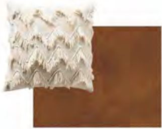
TAYLOR KING-TREVELYAN SOFA IN WYLIE FAWN