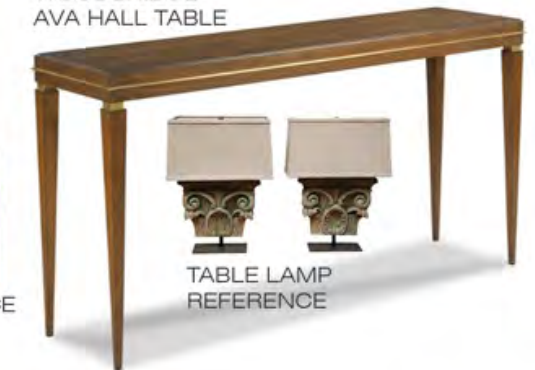
TABLE LAMP REFERENCE