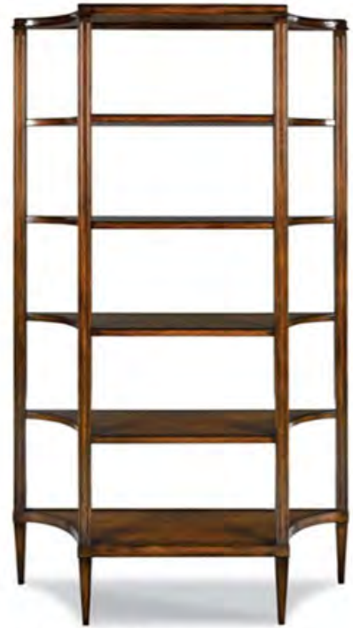
WOODBIDGE- ETAGERE BOOK SHELF