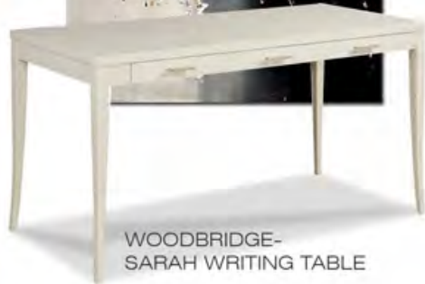
WOODBIDGE- SARAH WRITING TABLE