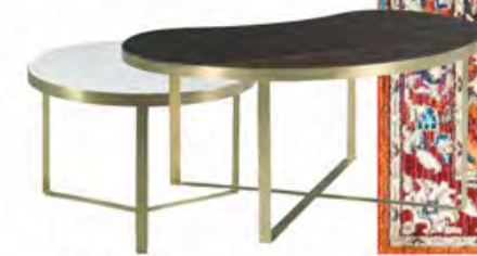
WOODBIDGE-LENNOX SPOT TABLE (2) PHIPPS COCKTAIL TABLE