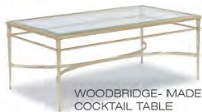
WOODBIDGE-MADELINE COCKTAIL TABLE