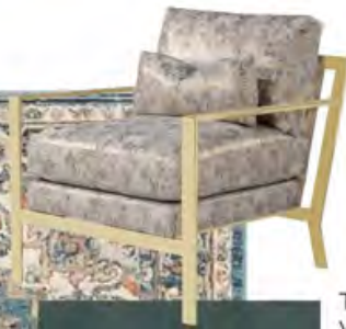
TAYLOR KING-VEGA CHAIR IN HAVEN JUNIPER