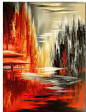
ARTWORK REFERENCE 01 ABOVE TREVELYAN SOFA