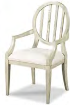
WOODBIDGE- EMMA ARM CHAIR