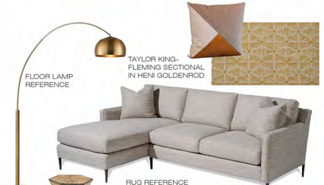
FLOOR LAMP REFERENCE