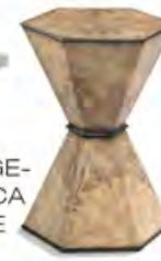
WOODBIDGE-CASA BLANCA DRINK TABLE