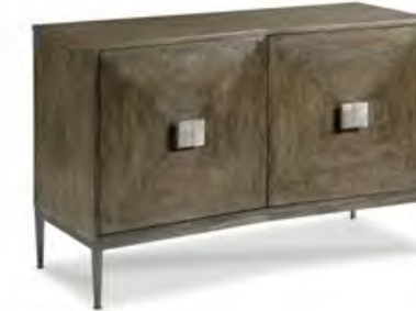
WOODBIDGE- LANGFORD CABINET