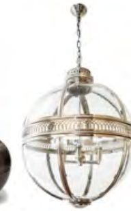
KINGS HAVEN- CHANCELLOR GLOBE IN ENTRY FOYER