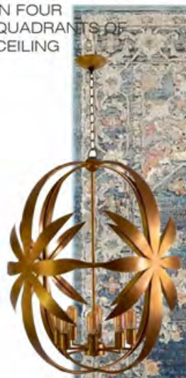
KINGS HAVEN-FLEUR CHANDELIER IN FOUR QUADRANTS OF CEILING