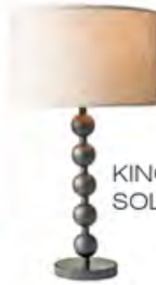
KINGS HAVEN-SOLEIL TABLE LAMP (2)