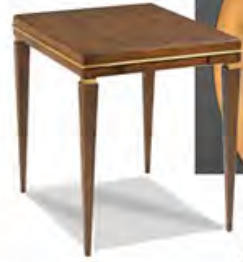
WOODBIDGE-AVA LAMP TABLE (2)