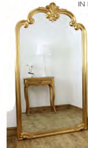
ORNATE MIRROR REFERENCE ABOVE FIREPLACE