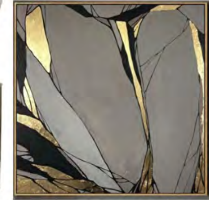
KINGS HAVEN- SAIL SCENCE ON EITHER SIDE OF ARTWORK 03