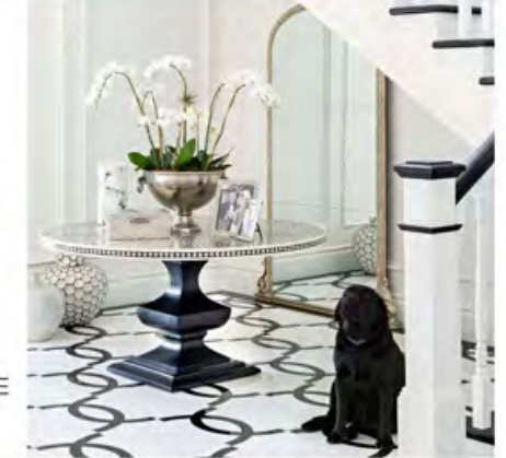
ENTRY FOYER ROUND TABLE REFERENCE